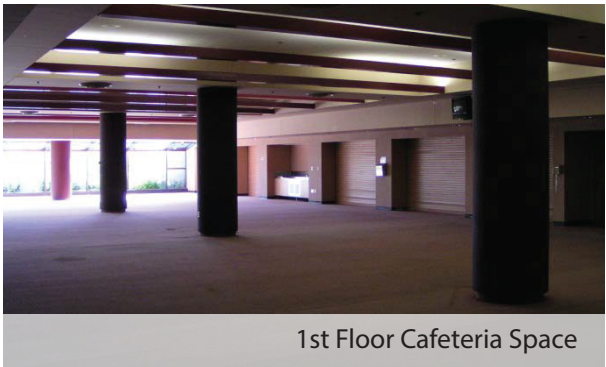
1st Floor Cafeteria Space