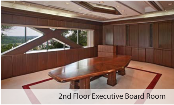
2nd Floor Executive Board Room