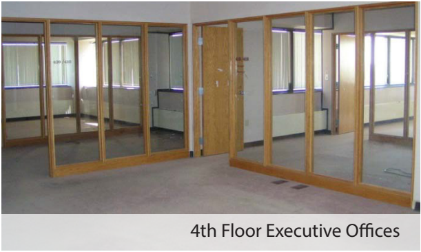
4th Floor Executive Offices