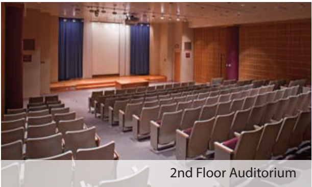
2nd Floor Auditorium