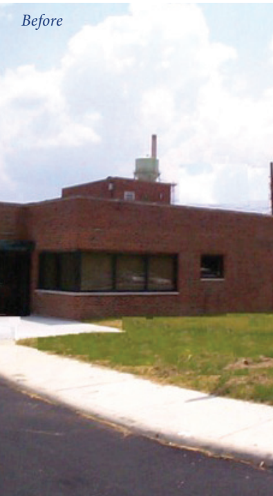
Demolition of Building 28